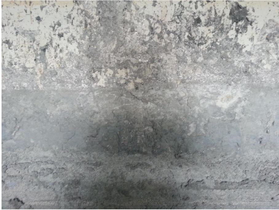
After melt out